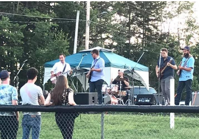
A few purchases at the Wellington Station House Vendors Market, a community meeting and a TGIF at the Meaghers Grant Community Hall, a September 2021

90 th Birthday party for a long time Fall River resident (and my neighbour) , a few resident meetings, Lock4 visit and checking on a few updates at the Village Green.