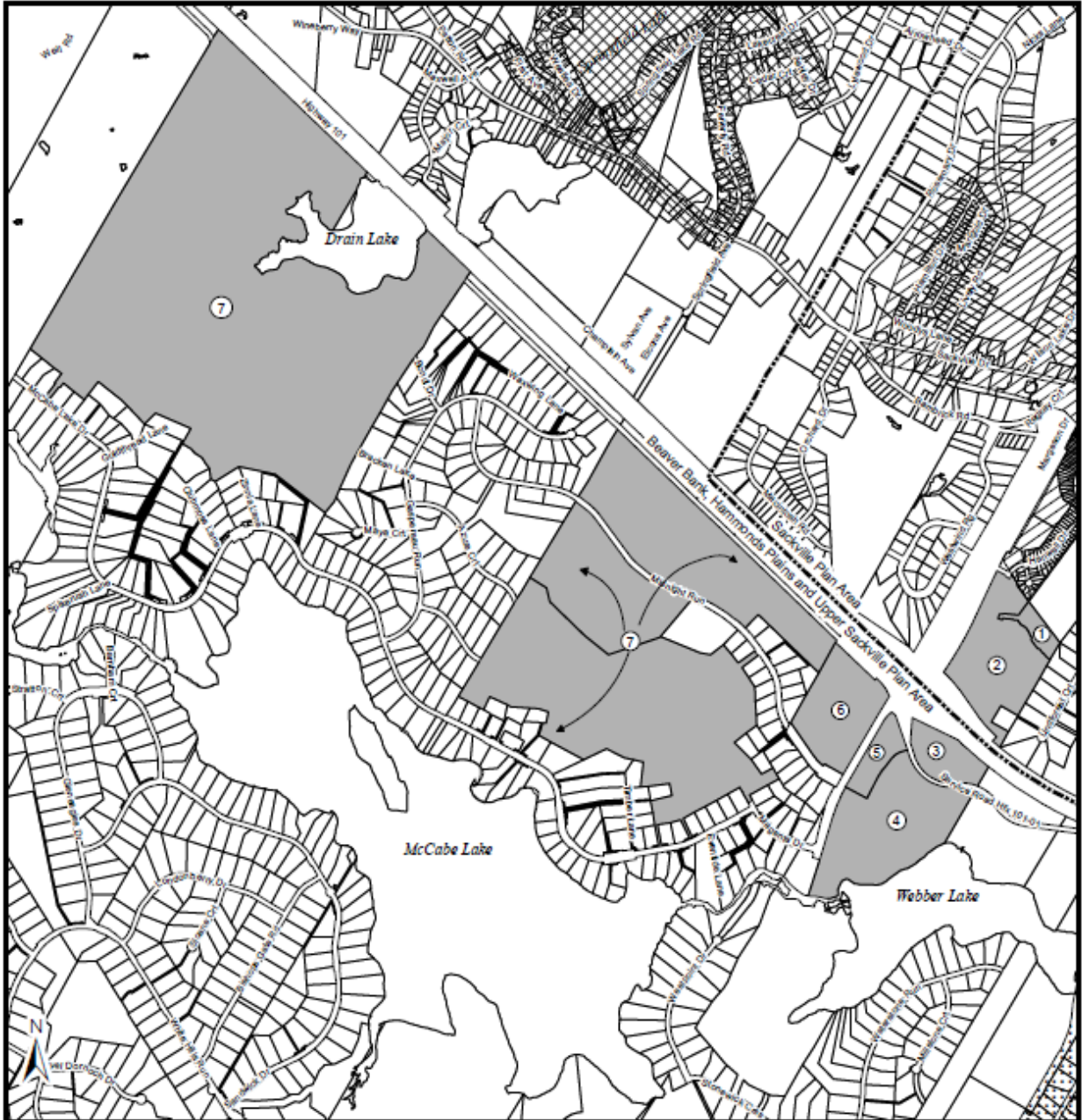
Map 1: Proposed Margeson Drive and Highway 101 Master Plan Study Area