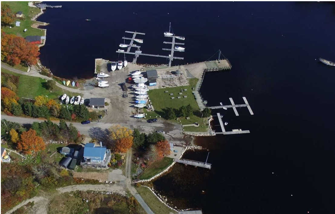
Hubbards Community Waterfront Association (HCWA) 20 Yacht Club Rd, Hubbards, NS B0J 1T0

The partners in this event see these upgrades as critical not only for the event, but in the ability to attract future sailing opportunities to the community and ensure the Hubbards waterfront remains an active part of the community.