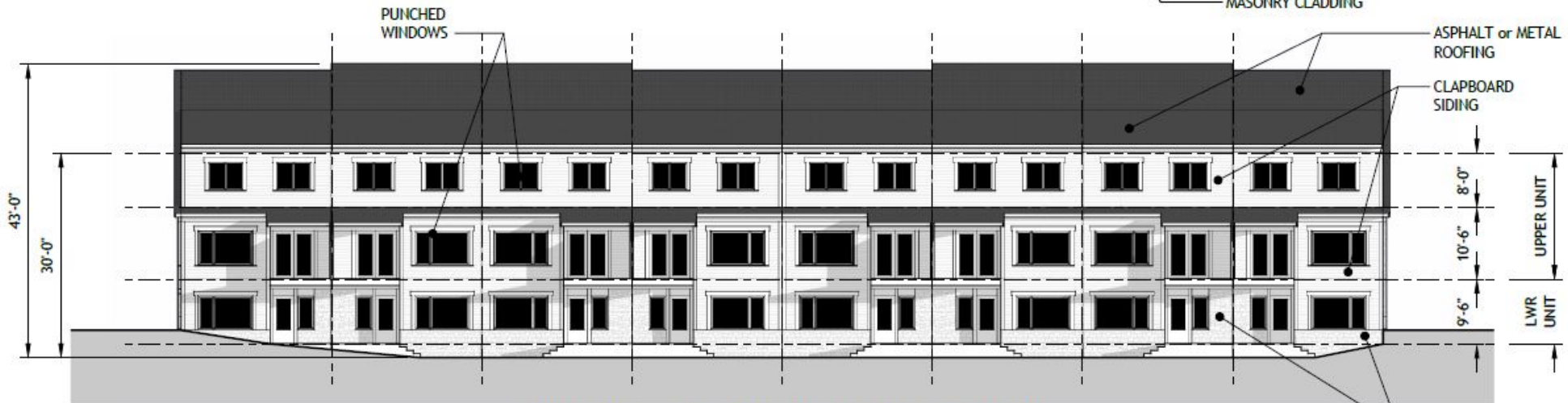
BUILDING ' A ' - THISTLE STREET - SOUTH