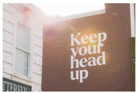
Lead Firm: Fathom Studio

Developer / Owner / Client Downtown Dartmouth Business Commission