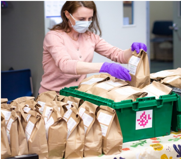
To-go bags being prepared at Alderney Gate Public Library for Curbside Pick-up across the municipality.