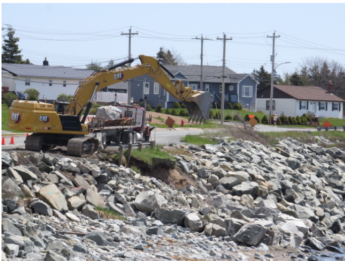
Shore Road reparation along shoreline.

As we've realized even more than ever during the pandemic, spaces such as parks, natural areas and community gardens promote physical, mental, and social health and tangible well-being for all. Learn more about these benefits, and find out more about exploring nature in the municipality here .