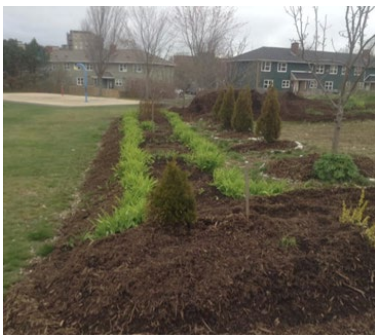
City Kidds Community Garden

Each municipal district received $94,000 for this fiscal year (2021/22) to use for district capital projects. These funds are available for