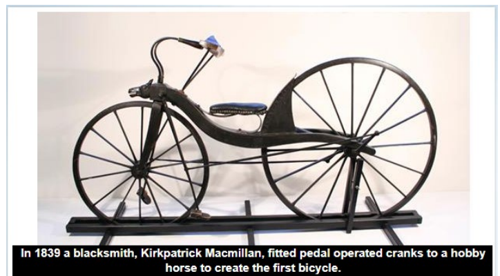
In 1839 a blacksmith, Kirkpatrick Macmillan, fitted pedal operated cranks to a hobby horse to create the first bicycle.