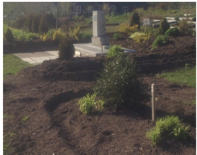
City Kidds Community Garden

For more information on the District 9 District Capital Fund and to apply for funding, visit the municipal website .