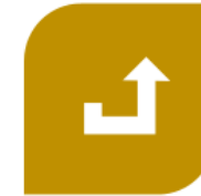
PHASE II: STABILIZATION GETTING BACK TO BUSINESS