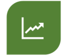
PHASE III: RECOVERY OPEN FOR BUSINESS