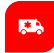
PHASE I: CURRENT URGENT HEALTH CRISIS