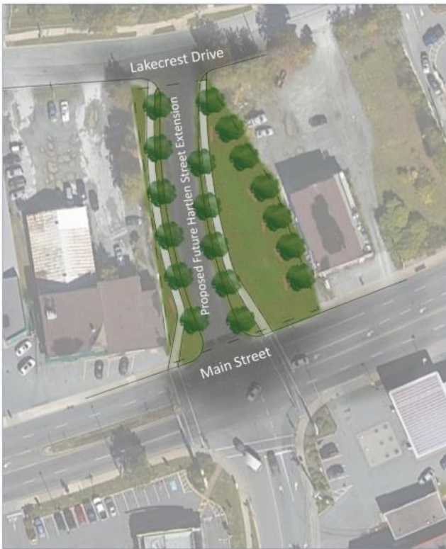
This drawing is an artist's rendering only—the final layout will be determined through detailed engineering design.

74 Lakecrest and 145 Main St. were demolished last month as part of the long-term vision for the Village on Main area. Hartlen Street is being extended to connect with Lakecrest Drive to create a more walkable and vibrant neighbourhood.