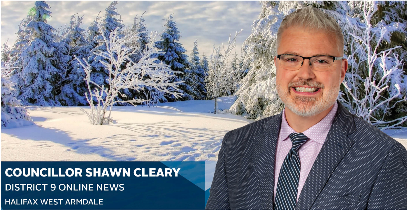
COUNCILLOR SHAWN CLEARY DISTRICT 9 ONLINE NEWS HALIFAX WEST ARMDALE