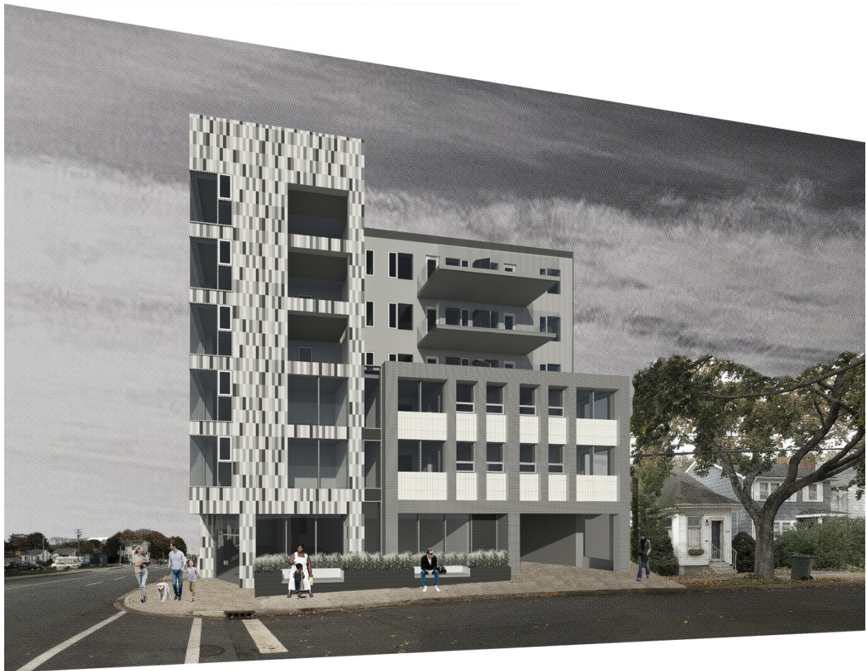
Image A Young Street Rendering

Images - 6.1 Level III Site Plan Approval Application for 3077 and 3085 Oxford Street, 6387,6389 and 6393 Young Street, Halifax