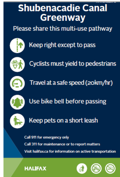
Sample of HRM Trail Etiquette Signage

I put forward a motion that was passed unanimously by Halifax Regional Council to endorse the trail etiquette signage process as indicated in the staff report dated June 26, 2020.