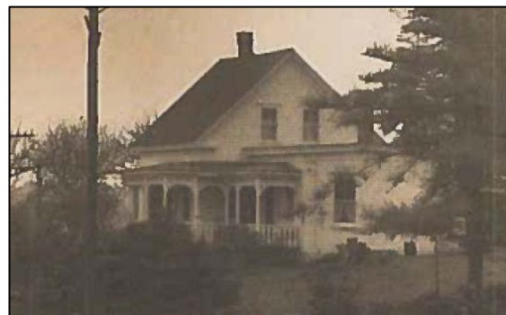
Figure 6: Photo of 10175 Highway 7 in the 1920s