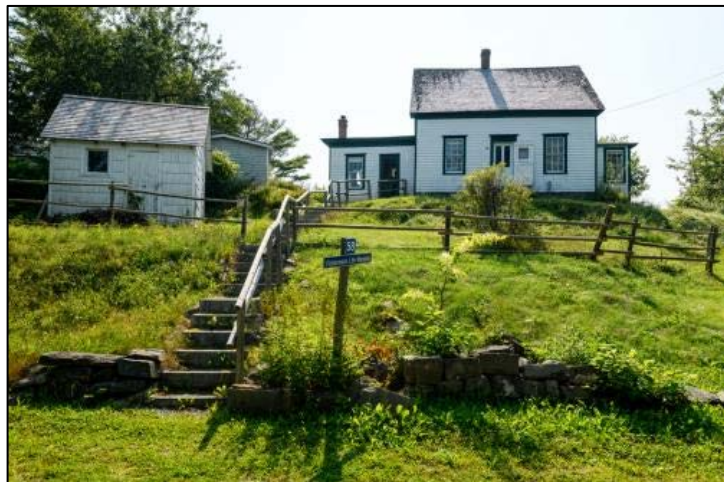
Figure 9: Photo of the Fisherman's Life Museum ( https://fishermanslife.novascotia.ca/about-fishermans-life-museum )

The area is characterized by small single detached dwellings on larger lots grouped along Highway 7 and the waterfront. The property fits in well with this established building pattern and reflects the history of the area. The house located at 10175 Highway 7 was built and owned by the Myers family, a prominent family in the history of the Jeddore area. This community was settled by working class families and the form and style of the house was very common. The area currently features