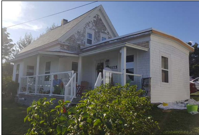
Figure 4: Photo of 10175 Highway 7 in 2019

The Myers House is a one-and-a-half storey, wood frame structure. It has a steeply pitched gable roof and features wood shingle siding. A one storey addition was constructed on the eastern side of the house prior to 1909 (the addition is visible in the background of Figure 3) to create a summer kitchen. The building also features a prominent veranda along the façade that was original to the house but has been simplified in design.