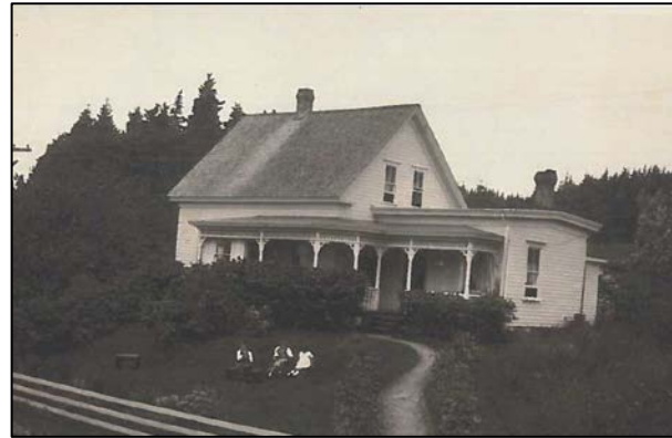
Figure 7: Photo of 10175 Highway 7 in 1930

The original wooden windows in the house have been replaced with modern materials but are still in their original locations. The chimneys have been simplified and the chimney of the summer kitchen completely removed.