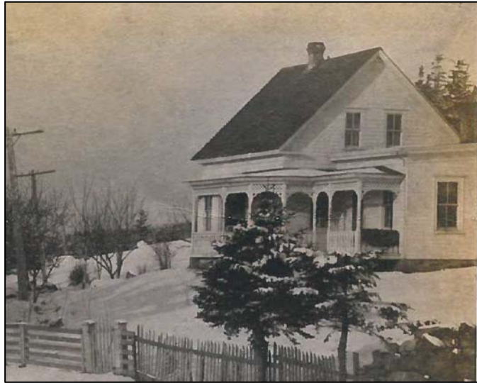
Figure 1: Photo of 10175 Highway 7 in the 1920s