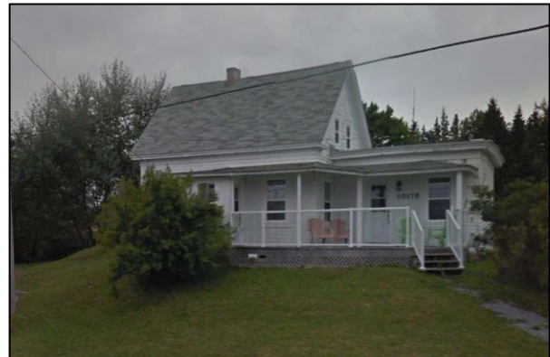
Figure 8: Image of 10175 Highway 7 in 2018