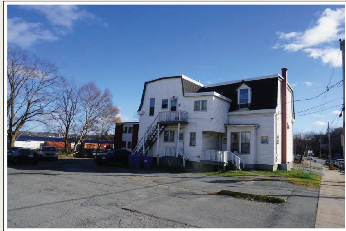
View of existing building from northwest corner