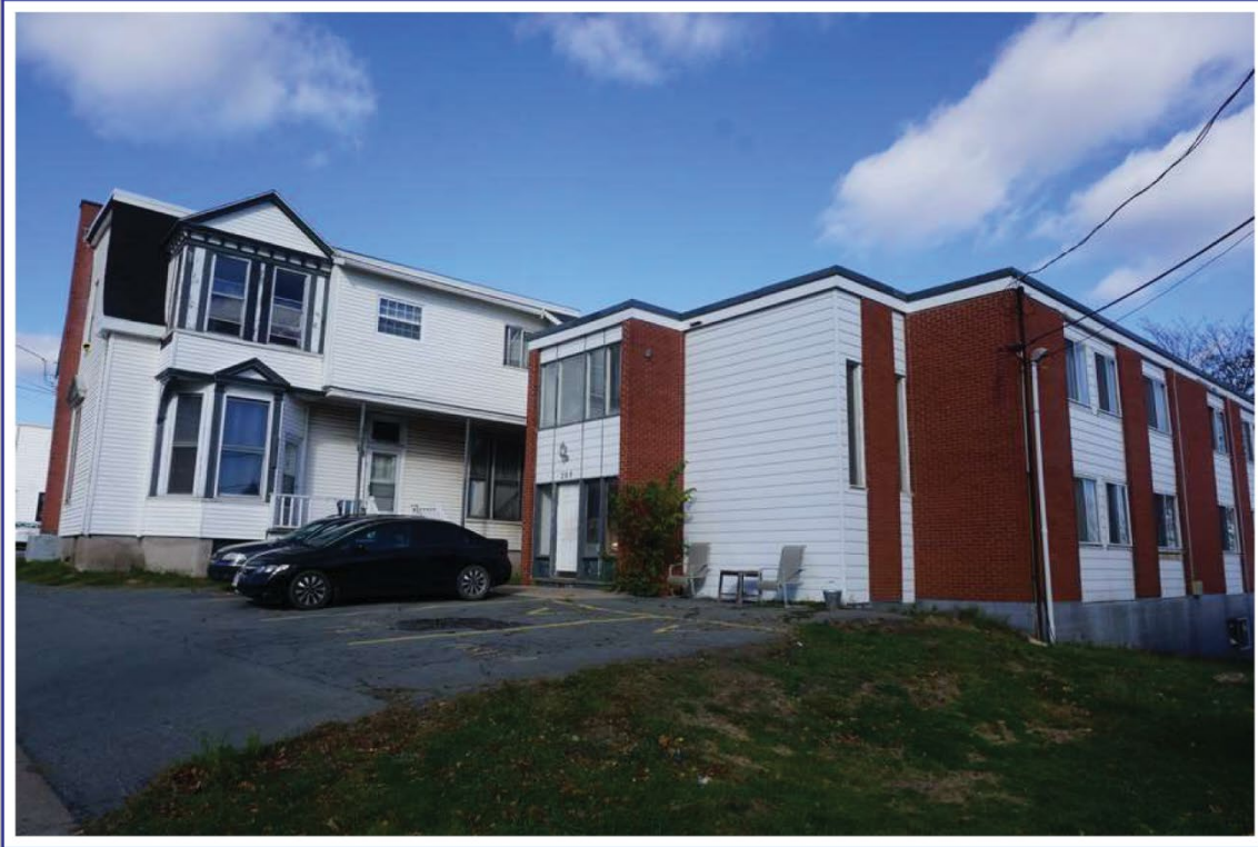
View of existing building from southwest corner