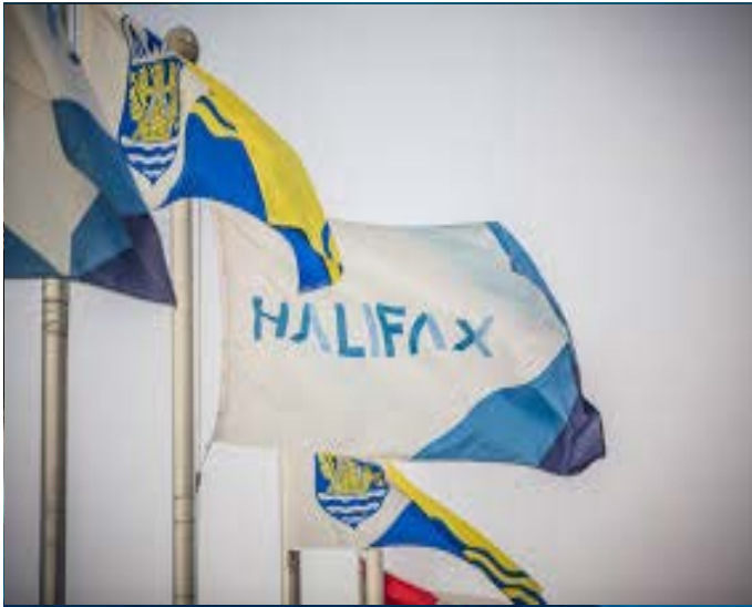
DEPUTY MAYOR LISA BLACKBURN DISTRICT 14 ONLINE NEWS MIDDLE/UPPER SACKVILLE - BEAVER BANK - LUCASVILLE