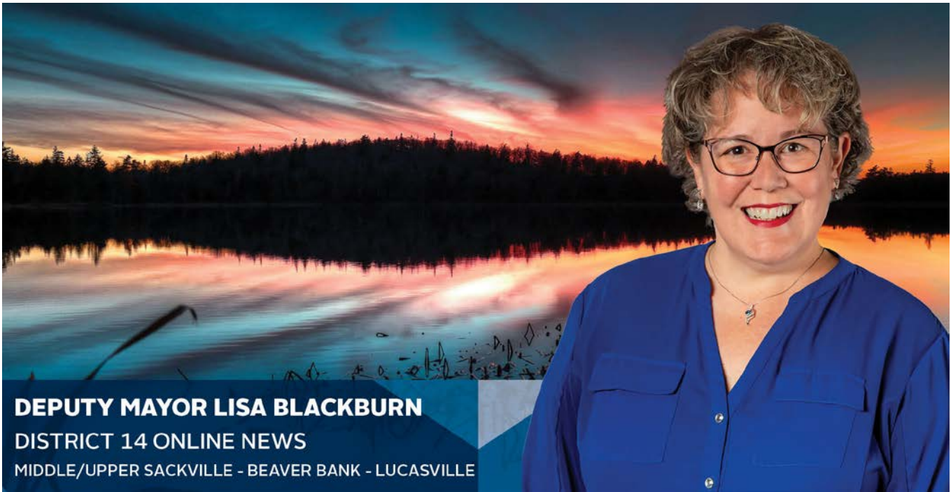
DEPUTY MAYOR LISA BLACKBURN DISTRICT 14 ONLINE NEWS MIDDLE/UPPER SACKVILLE - BEAVER BANK - LUCASVILLE