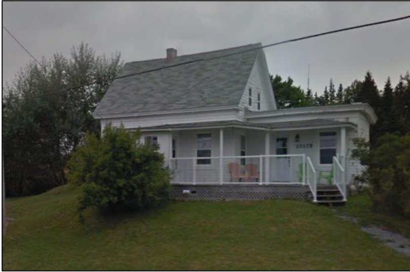
Myers House - 10175 Highway 7