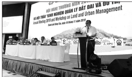
I had the tremendous honour of representing Canada and Nova Scotia at the Association of Cities of Vietnam Annual Meeting in Vung Tau, where I gave a keynote address on property tax.