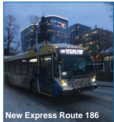
New Express Route 186

Future enhancements will include improved connectivity with the adjacent Trans Canada Trail system on the Cole Harbour Commons through to the Bissett Greenway.