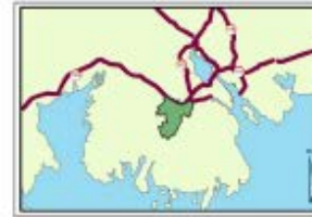
Figure 23 Phasing Strategy