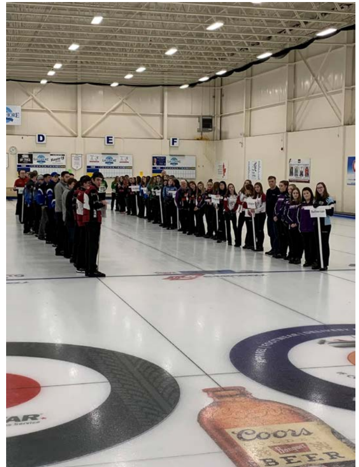
Some of our amazing, talented athletes competing in the U-21 Junior Provincial Curling Championships at Lakeshore Curling!