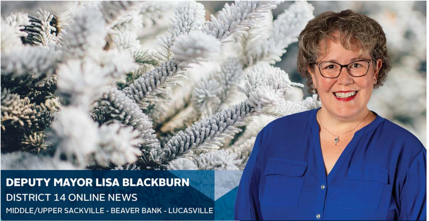
DEPUTY MAYOR LISA BLACKBURN DISTRICT 14 ONLINE NEWS MIDDLE/UPPER SACKVILLE - BEAVER BANK - LUCASVILLE