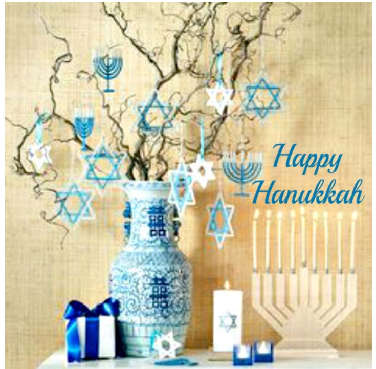
Hanukkah, known as The Festival of Lights, begins at sunset on Sunday, December 22nd and ends at nightfall on Monday, December 30 th .