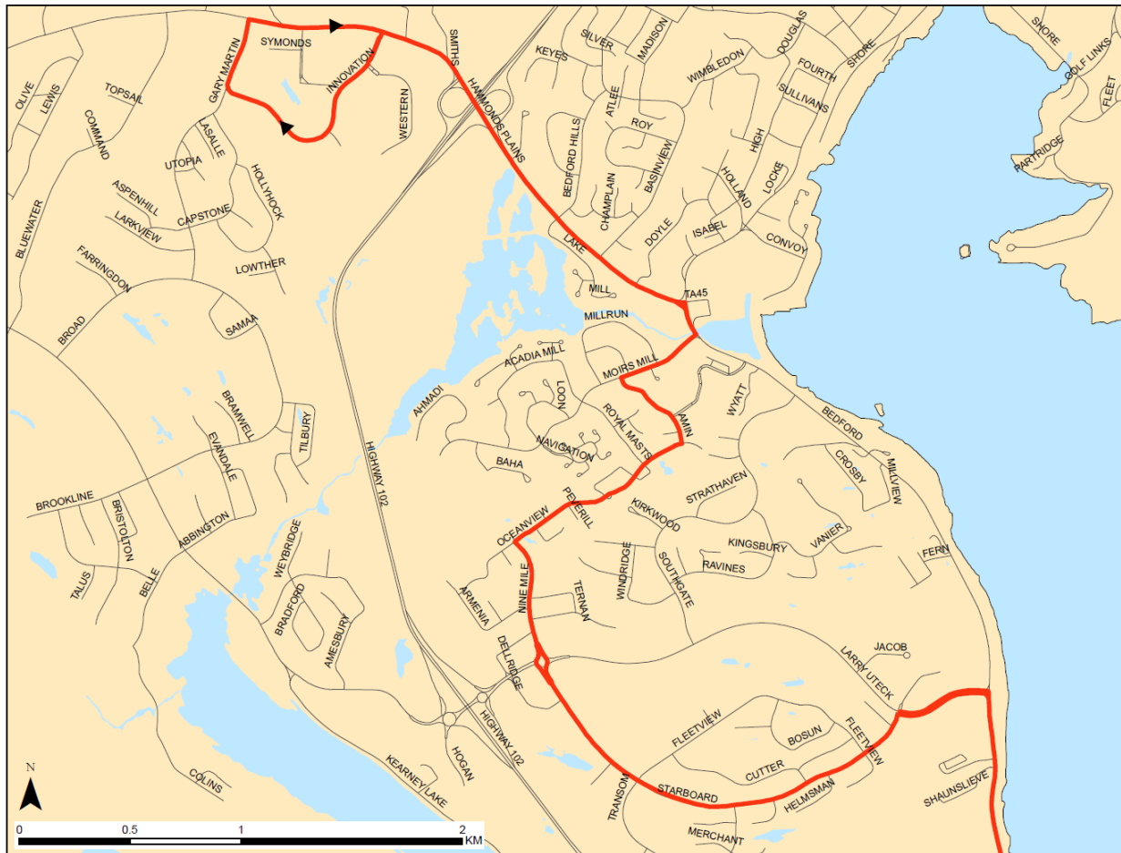
Figure 1: Route 91 Hemlock Ravine as per Approved 2019/20 Annual Service Plan

There is currently no transit service on Oceanview Drive. The Moving Forward Together Plan (MFTP), as approved by Regional Council in 2016, introduced Route 91 Hemlock Ravine to the surrounding area. The Route 91 Hemlock Ravine was updated with minor routing changes in the 2019/20 Annual Service Plan (approved by Regional Council in 2019) to provide operational improvements as illustrated below.