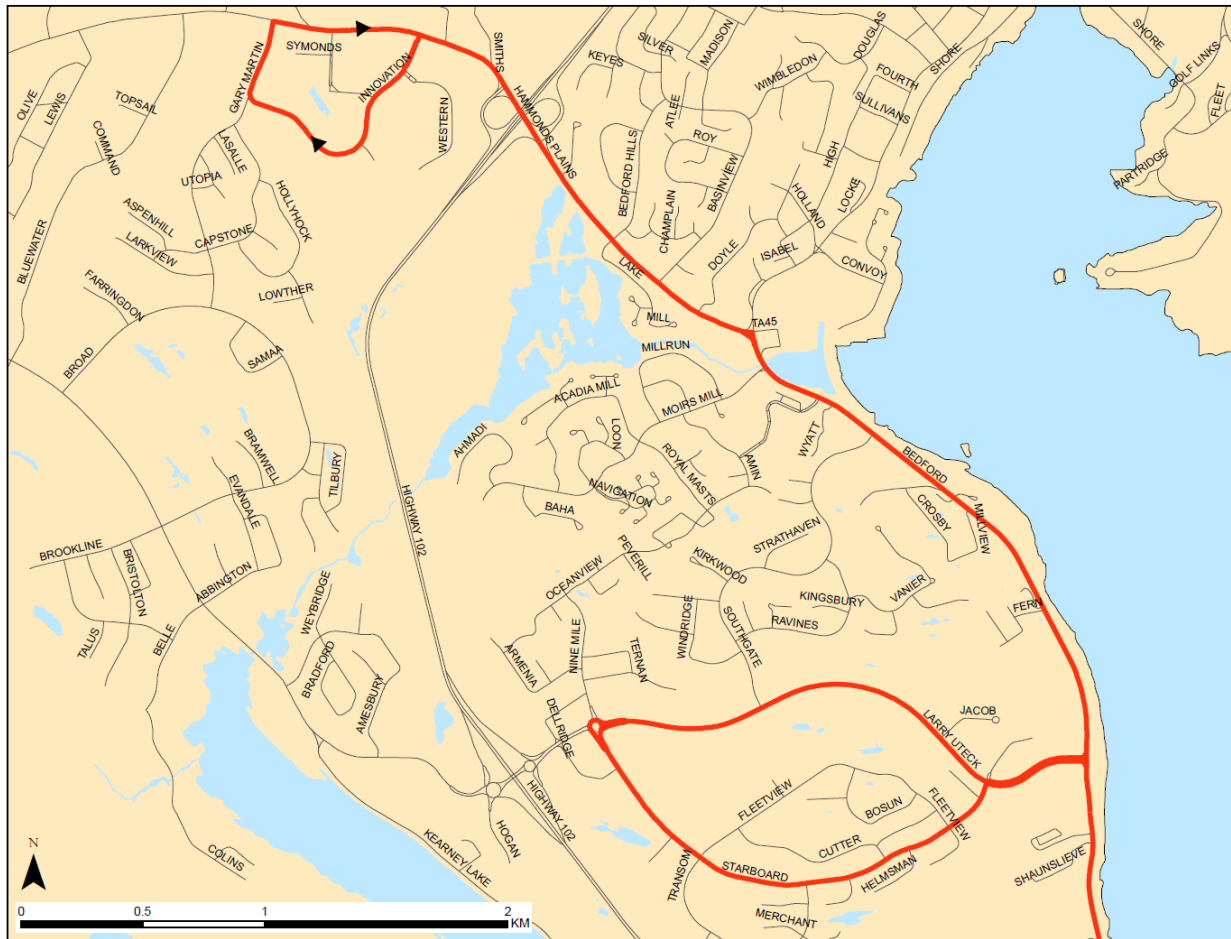
Figure 4: Route 91 Hemlock Ravine Alternate Detour