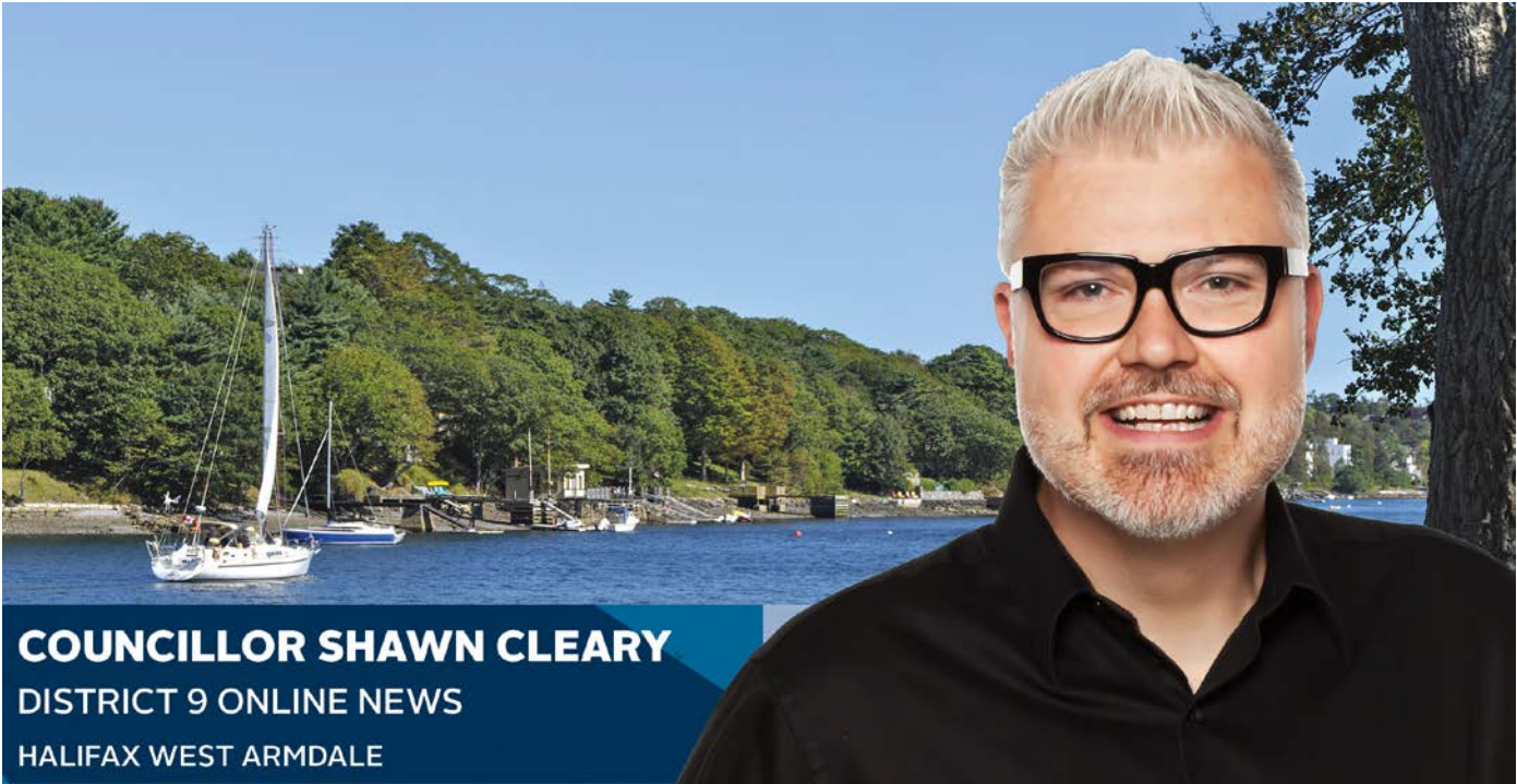
COUNCILLOR SHAWN CLEARY DISTRICT 9 ONLINE NEWS HALIFAX WEST ARMDALE