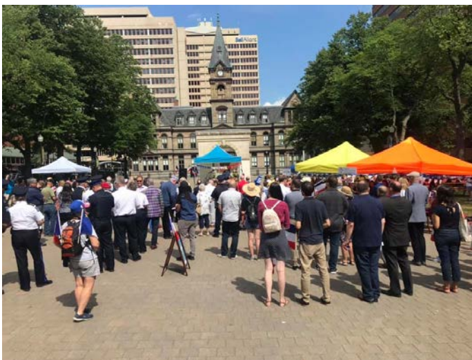
Flag raising at Grand Parade August 15 th for National Acadian Day

WEEKLY GREEN CART COLLECTION CONTINUES TO SEPTEMBER 30 TH