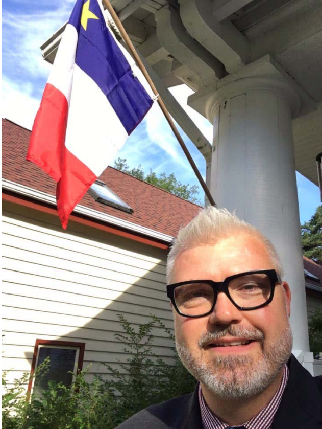
Happy National Acadian Day!

SEPTEMBER 21 ST IS QUINFEST FAMILY FUN DAY!