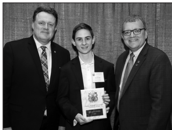
William Cooper Fountain Academy of the Sacred Heart