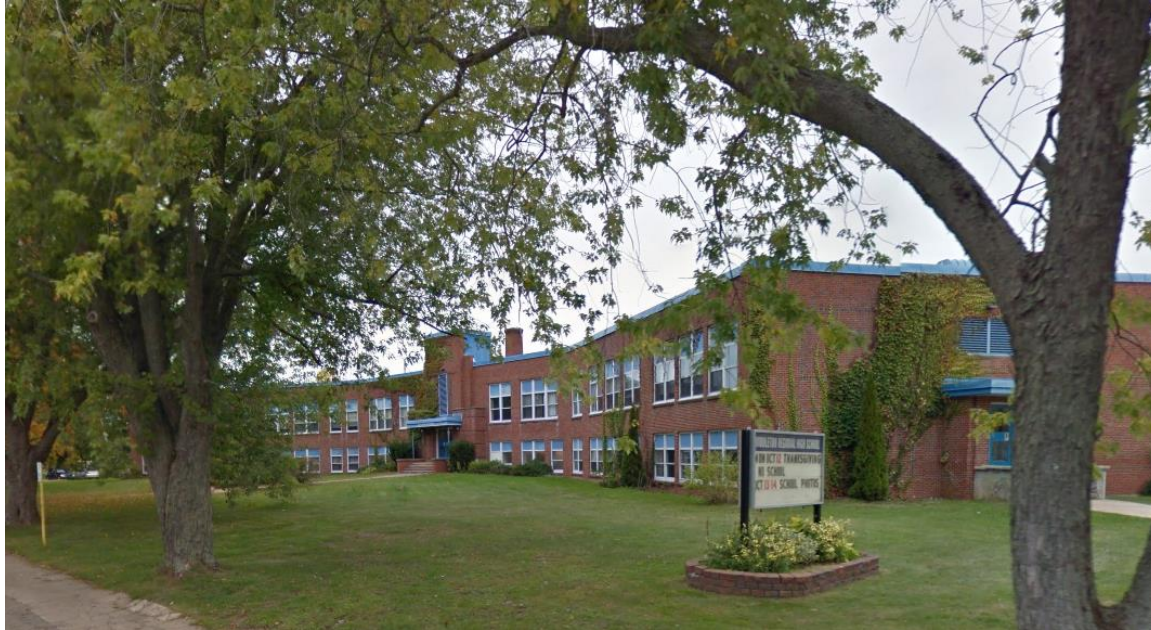
Middleton Regional High School, Middleton NS