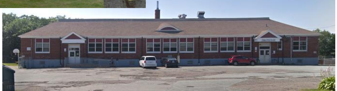
Flemming Tower School, Jollimore NS