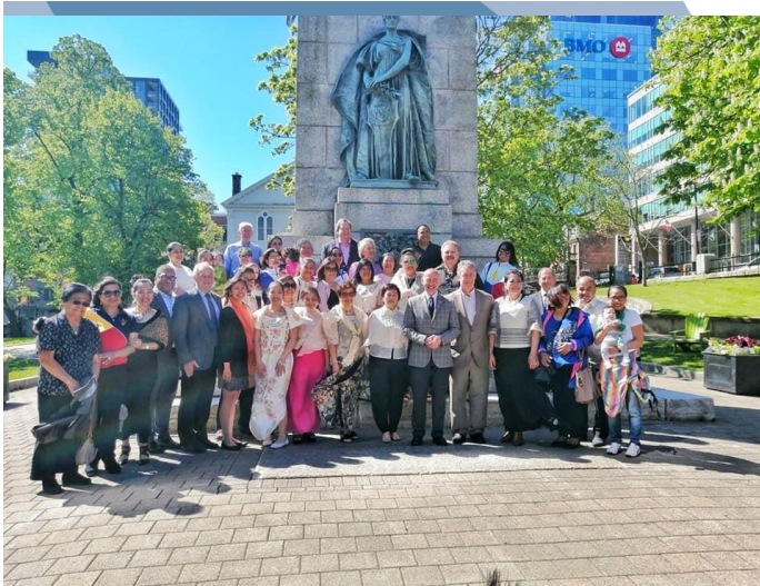
Filipino Heritage Month Flag Raising and Tree Planting Ceremony

We had bouncy castles, face painting, activities for the whole family and of course, food. Thank you to Nova Scotia Power for cohosting and Glow and Sobeys for sponsoring the event, it was great to serve over 500 people and see the community come together in this beautiful new park!