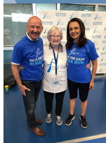
Do It For Dad Prostate Cancer Walk

In the meantime, residents can report street tree damage by calling 311. For more information on the Urban Forest Master Plan, visit the website .