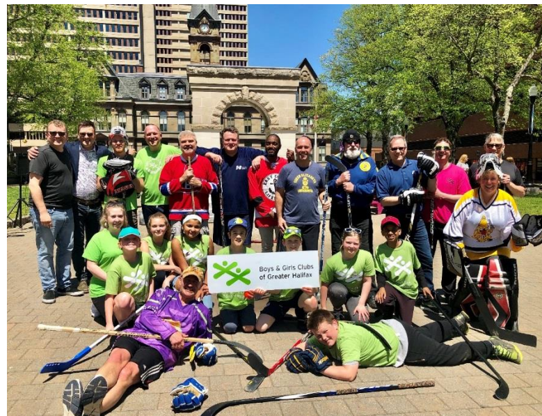
"Unplug to Connect" hockey game against the Boys and Girls Club

In recent years, their ability to host regattas in Dartmouth has been hindered, as aquatic weeds get tangled in the model boats. For more information on the agreement, you can find the report here .