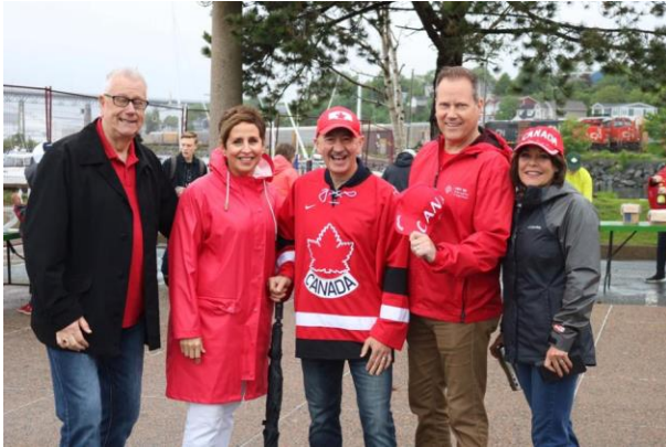
Happy Canada Day!