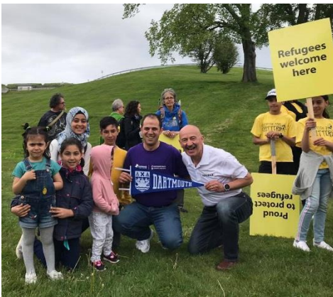
Walk for Refugees last month