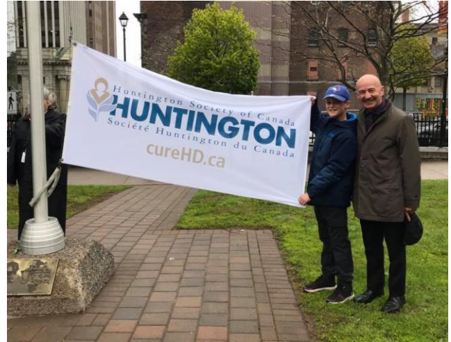
Huntingtons Awareness Month Flag Raising

A total of 61 vehicle/pedestrian/bicycle collisions have been reported from January to March 2019 in Halifax Regional Municipality. This represents an increase of one incident over the same time period in 2018. You can read the full report with details and analysis on March collisions. Over 64% of the incidents occurred in crosswalks. Our Heads Up Halifax program recently awarded four grants to community organizations to implement new crosswalk safety measures. You can find out more about these initiatives here .