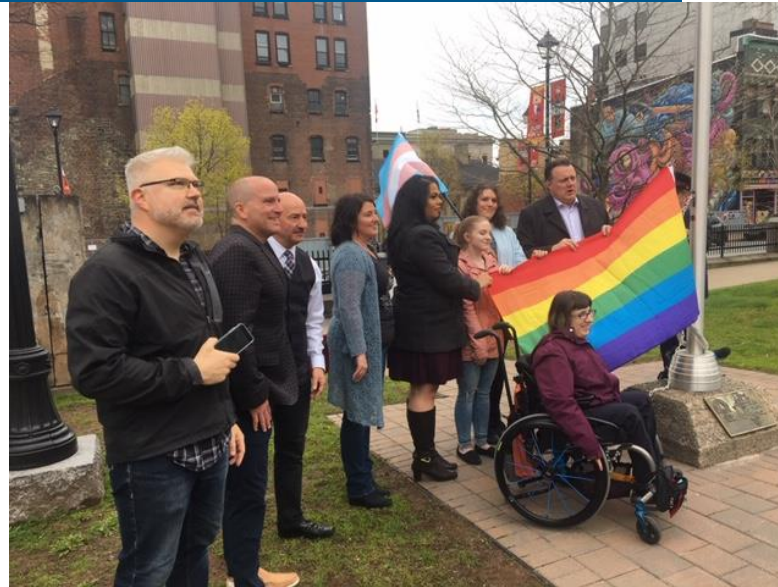
Pride Month Flag Raising

The next phase of public engagement will begin in Fall 2019 and will focus on fostering a dialogue among members of the public. For more information, see their website .