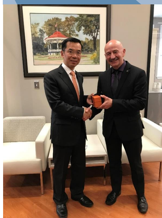
H.E. LU Shaye Ambassador of the People’s Republic of China to Canada

The Dartmouth Family Centre and Dartmouth North Community Food Centre are amazing resources for our community. They run weekly programs, special training and events every month. Check out the Family Centre’s June calendar here and the Food Centre calendar here .