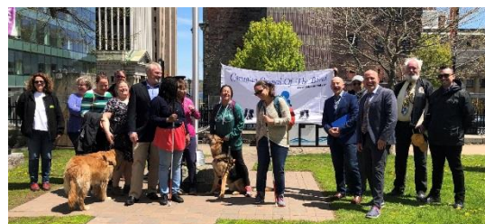
Canadian Council of The Blind Flag Raising

Je suis actuellement dans la belle ville de Québec à l'occasion de la conférence de la Fédération canadienne des municipalités (FCM). J'ai eu l'occasion d'apprendre d'experts, de réseauter avec plus de 2 000 délégués et de contribuer à influencer le programme municipal avec d'autres ordres de gouvernement. Le thème de cette année était « Bâtir de meilleures vies », étant centré sur la mission de la FCM d'intervenir dans les dossiers qui comptent le plus pour les familles et les travailleurs afin d'améliorer notre qualité de vie. Le temps plus doux est une excellente occasion d'aller en plein air et de trouver des façons de bouger. Juin est le mois des loisirs, et je tiens à remercier notre formidable personnel des parcs et des loisirs de l'excellent travail qu'il fait pour engager nos communautés et encourager les personnes de tous âges à être actives. Consultez notre page sur les loisirs pour plus de détails sur les programmes, les parcs et les activités près de chez vous.