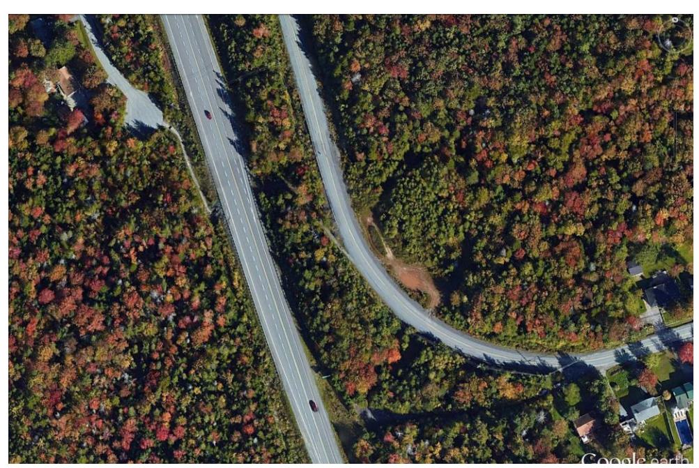
Figure 1 Approximate Crossing Point