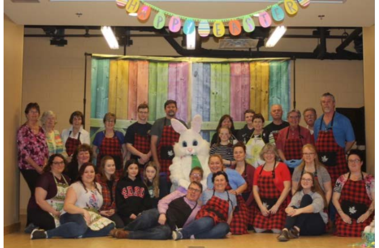
Beaver Bank Kinsac Community Centre volunteers for the Breakfast with the Easter Bunny event.

Vibrant communities are a result of generous volunteers who work tirelessly, often behind the scenes, to provide us with wonderful family events like the recent Breakfast with the Easter Bunny . This photo shows the number of hands needed to provide social gatherings like this one.