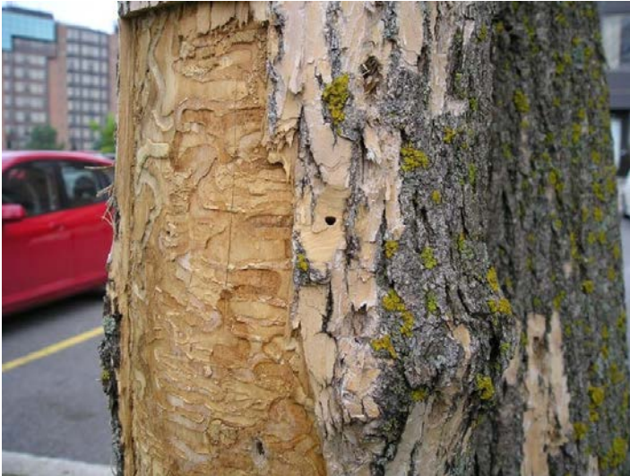
Signs of the Emerald Ash Borer are the "tunnels" found in Ash trees such as the one pictured above.

Due to the recent detection of the Emerald Ash Borer , residents are reminded that the movement of ash materials, including logs, branches, woodchips, and firewood of any kind is restricted by the Federal Government.