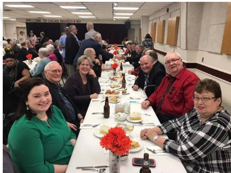
Sackville Rivers Association volunteers at the recent Lake District Recreation community dinner.