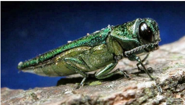
Emerald Ash Borer

Due to the recent detection of the Emerald Ash Borer , residents are reminded that the movement of ash materials, including logs, branches, woodchips, and firewood of any kind is restricted by the Federal Government.