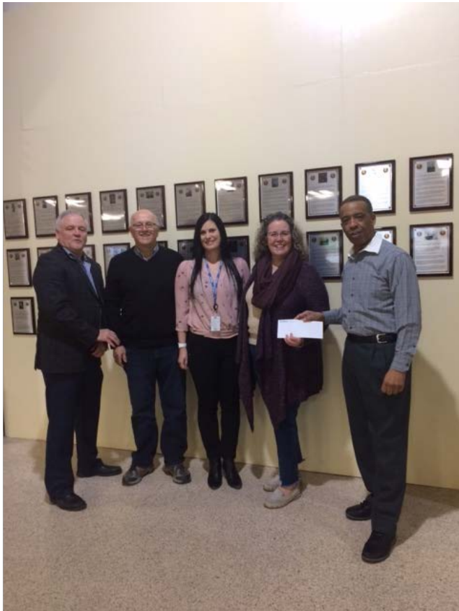
Here I am with the Sackville Sport Heritage Hall of Fame Board of Directors as they receive the District 14 District Capital donation for their new display at the Sackville Sports Stadium.