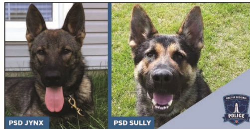
Promotional image social media post.

The K-9 Unit is an Integrated unit providing service to areas currently policed by Halifax Regional Police and Halifax District RCMP. We have eight teams of police service dogs and handlers.