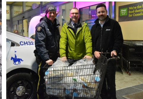
In late November Halifax District RCMP organized and participated with many business partners across the District for food and toy drives as well as the hugely successful launch on Nov 24 th of Pink Tape Day across the province.