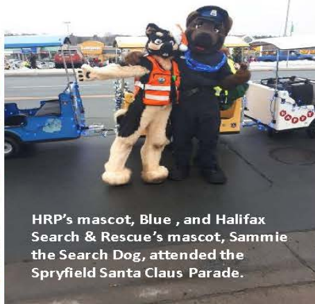
HRP's mascot, Blue, and Halifax Search & Rescue's mascot, Sammie the Search Dog, attended the Spryfield Santa Claus Parade.