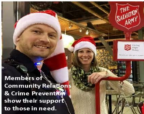
Members of Community Relations & Crime Prevention show their support to those in need.