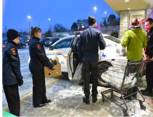
Stetsons & Spurs Youth Group in Cole Harbour in partnership with Sobey's Panavista, Hot Country 103.5 and Rock 105.1, held the 3rd annual Stuff a Cruiser for the Cole Harbour Food Bank.