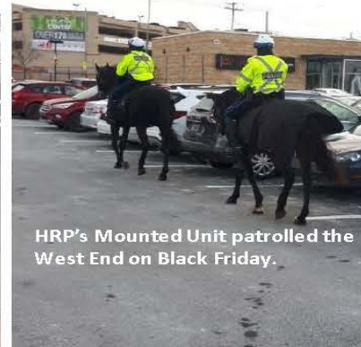
HRP's Mounted Unit patrolled the West End on Black Friday.