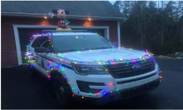
Lower Sackville Car 23 decked out for the Beaverbank Xmas Parade with a Special Guest.