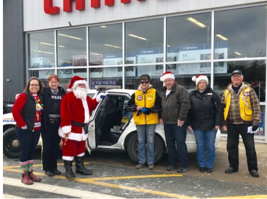
Hubbards Lions Club and the Upper Tantallon Canadian Tire store, held their annual Stuff the Cruiser Toy Drive on Saturday November 24th.