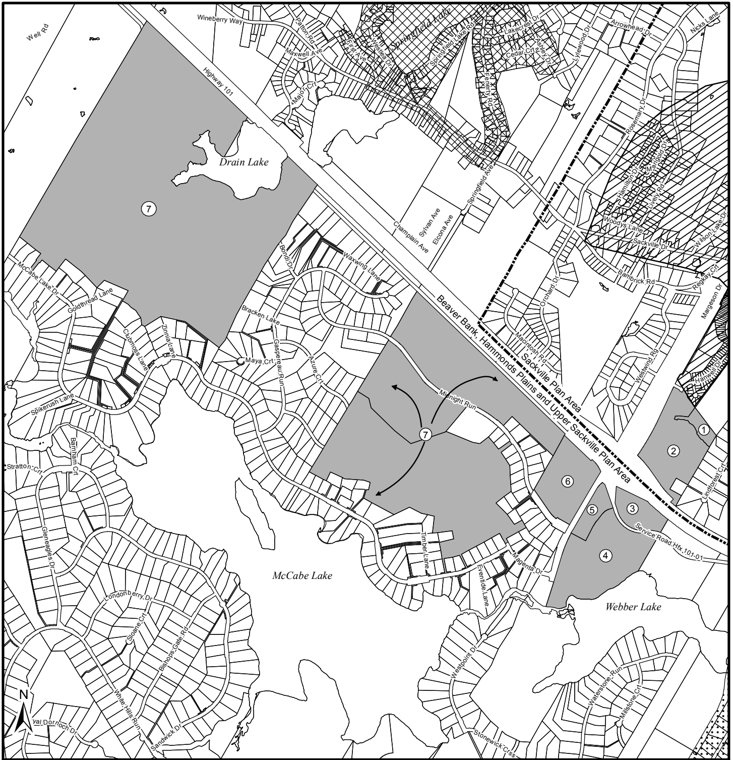
Map 4 - Proposed Margeson Drive and Highway 101 Master Plan Study Area