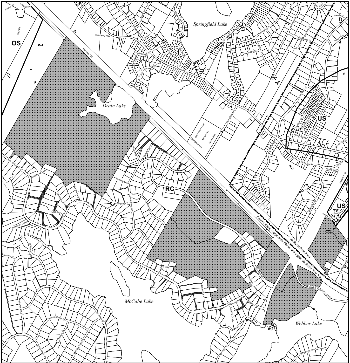
Map 1 - Regional Plan Generalized Future Land Use