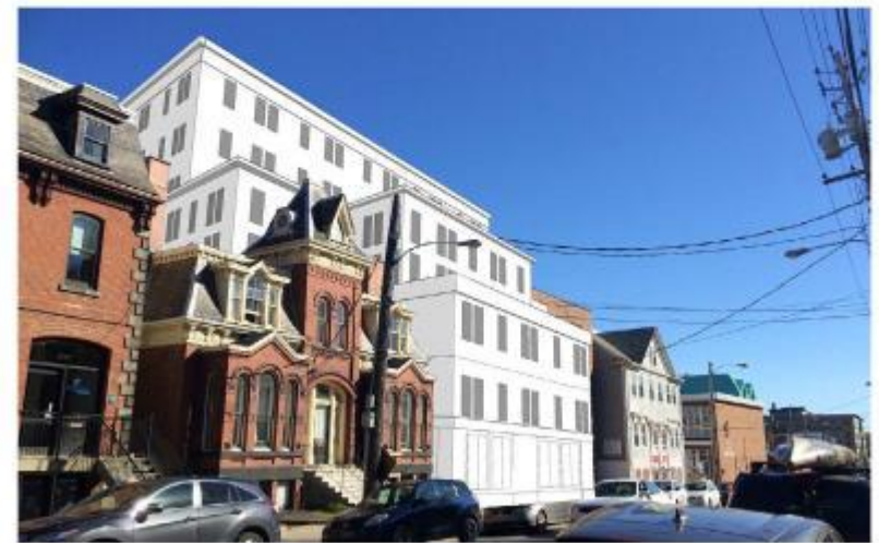
D 11 meter street wall with 28 meter building