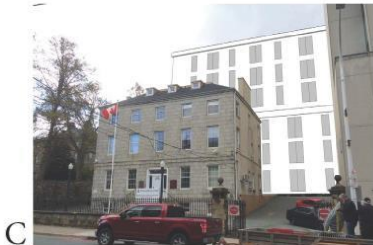
22 meter building within block - Recommended