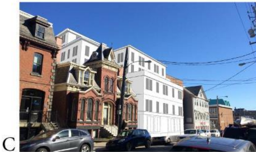
C 11 meter street wall with 22 meter building