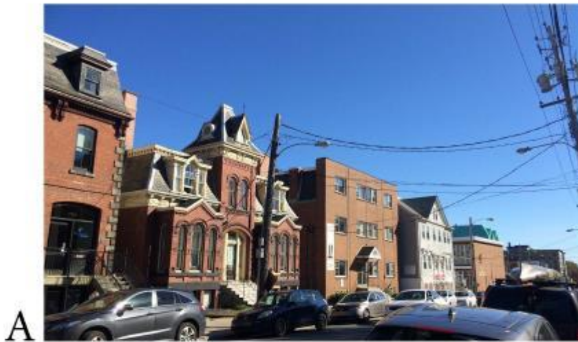
A Existing street view with no development