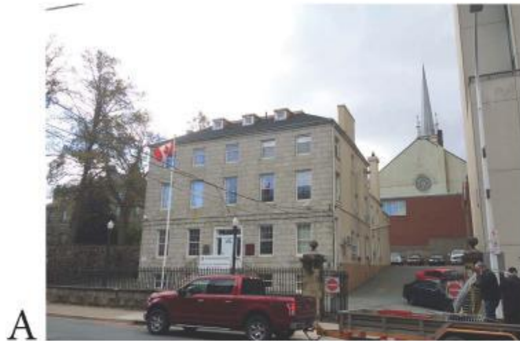
Existing street view with no development