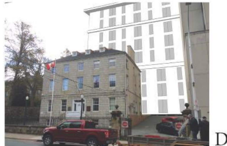
28 meter building within block