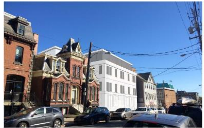
B 11 meter street wall with 14 meter building