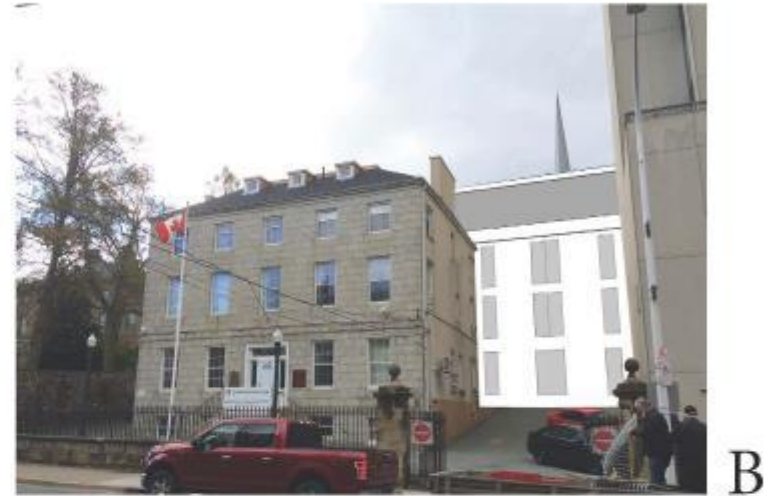
14 meter building within block