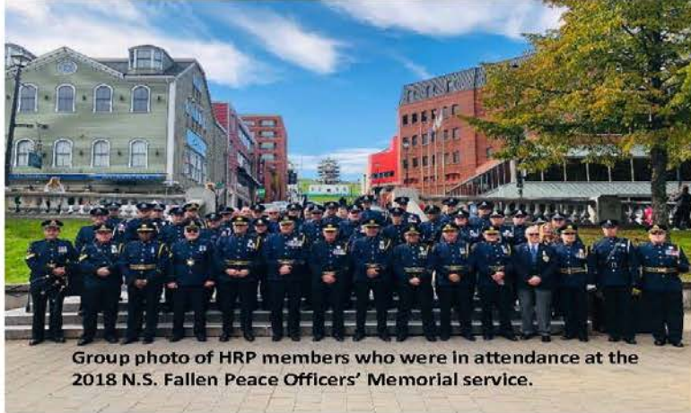
Group photo of HRP members who were in attendance at the 2018 N.S. Fallen Peace Officers' Memorial service.

On October 22, peace officers, first responders, civilians, military personnel & volunteers participated in the annual Nova Scotia Fallen Peace Officers' Memorial. Peace officers from across Nova Scotia paid tribute to peace officers in our province who gave the ultimate sacrifice.