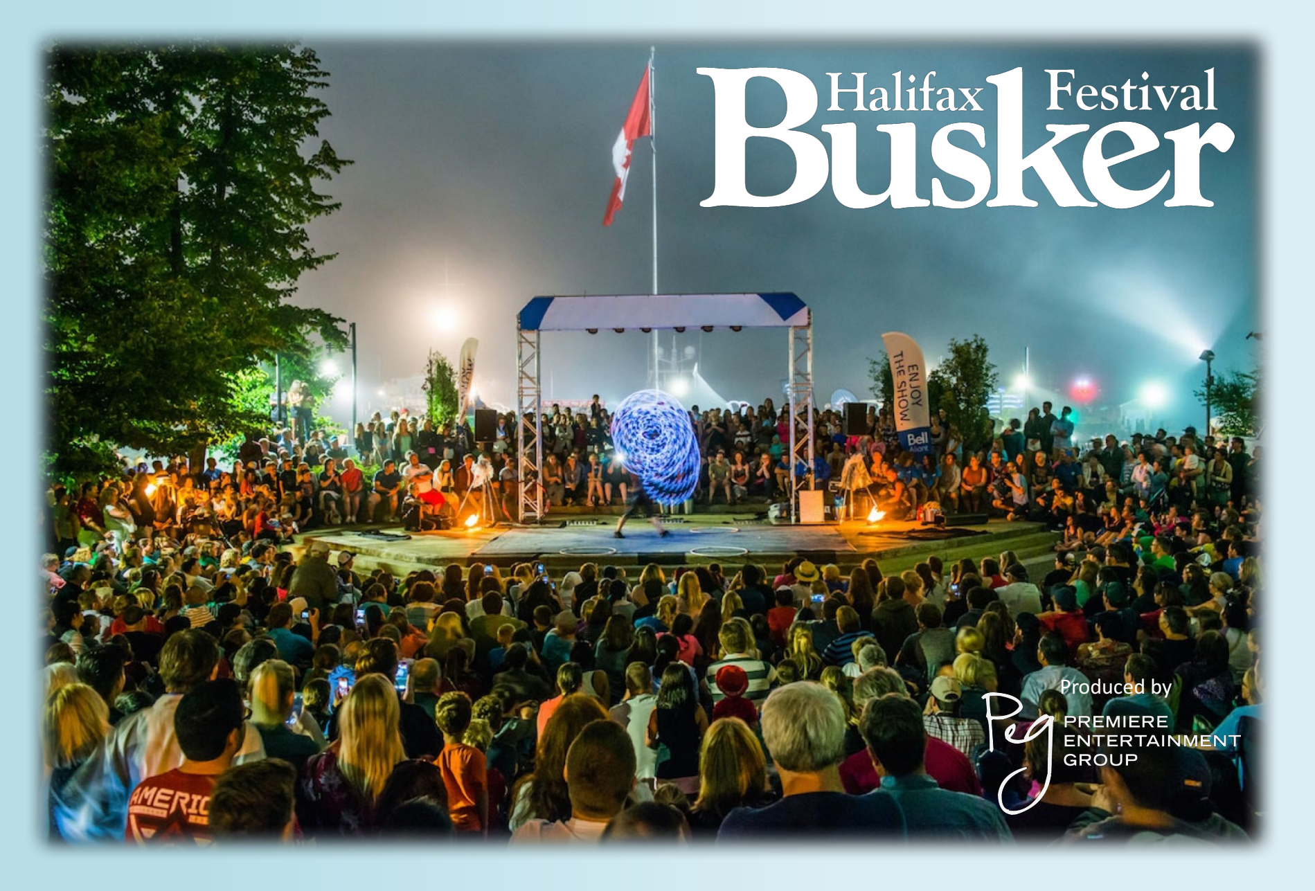
Celebrating 33 Years!