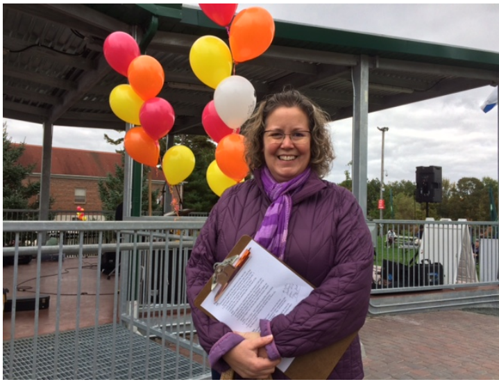
I was thrilled to host the Jazz Fest in Acadia Park!