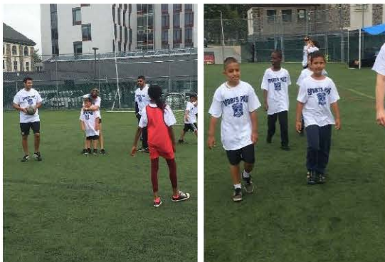
HRP officers taught soccer skills and drills to youth on Wickwire Field at Dalhousie University on July 31.