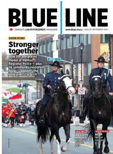
HRP was featured on the cover of the Aug/Sept Blue Line magazine (above). HRP officers provided site security at the CACP conference (below).

HRP was proud to co-host, along with RCMP Halifax District & Canadian Forces Military Police, the 113 th Canadian Association of Chief's of Police Annual Conference in Halifax last month.