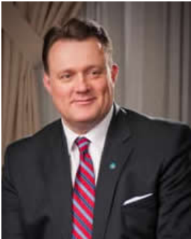
MIKE SAVAGE , Mayor of Halifax

The next five years promise to be a time of dramatic change for Halifax. Our new Economic Growth Plan gives us a glimpse of the progress and prosperity that is possible. This growth will see Halifax and, by extension, all of Nova Scotia competing with the world for business, talent, and investment.