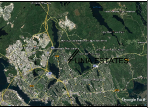
KEY PLAN : NTS