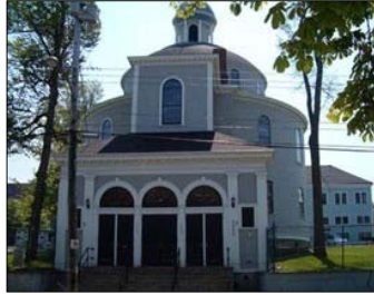
St. George's Round Church