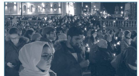
Over 1000 people attended a memorial at the Grand Parade to commemorate those lost in the Quebec massacre.