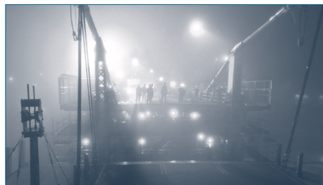
It was an honour to be on the MacDonalld Bridge as the last two segments of the Big Lift were lifted into place.