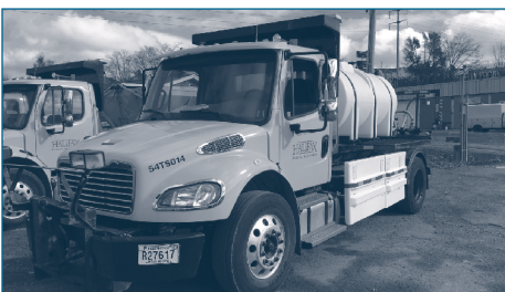
This truck has a sideguard installed. Sideguards save lives, and are being installed on all HRM and contractor vehicles over the next three years.

The administration and oversight of licensing appeals, including taxi licenses, is technically difficult & beyond the training & experience of most Councillors. The process of license appeals should be reviewed & amended to reflect that.