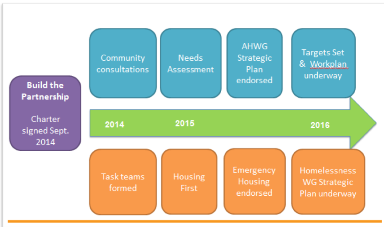
Fig. 1 Summary of the Housing & Homelessness Partnership Key Activities (2014-2016)

Regular updates on the work of the Partnership are available on the Partnership website ( http://housingandhomelessness.ca/ ). In 2014, the two working groups focused on engaging the community and stakeholder groups to develop an understanding of the issues, develop first key initiatives and develop action plans. The following include a brief summary of the key activities of the two working groups.