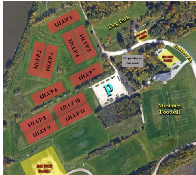
Figure 1 - Field Map from the 2015 Canadian Ultimate Championships in Winnipeg, MB. This facility incorporates football, soccer, rugby and ultimate in one location.

Local, regional, and national championship ultimate events are tournament-based and require numerous games happening simultaneously and at same site. At a typical tournament, a team will play 3-5 games (with each game approximately 2 hours long) in a single day. In order to host these kinds of events, the community needs a multi-field facility in Halifax.