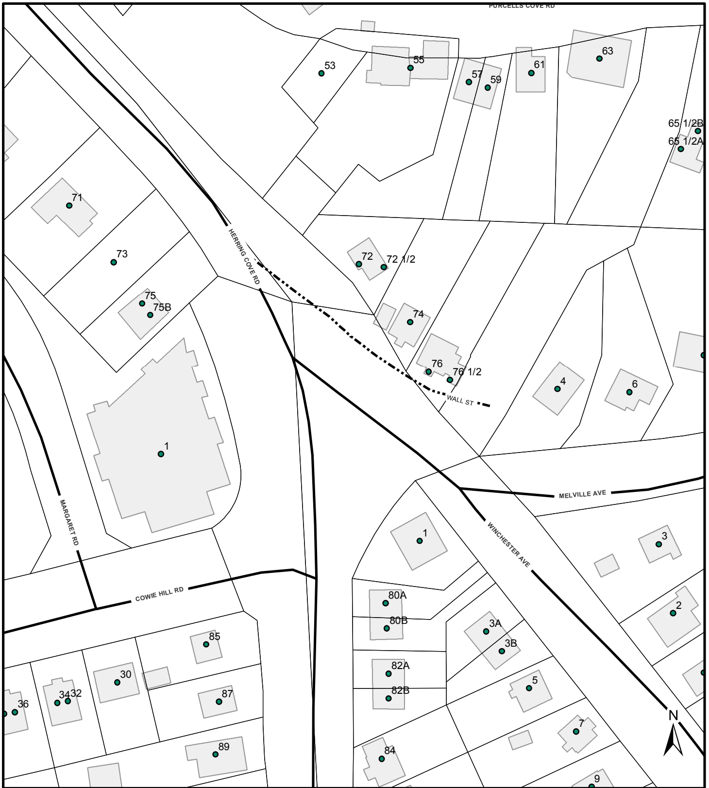
Map 2- Wall Street, Halifax