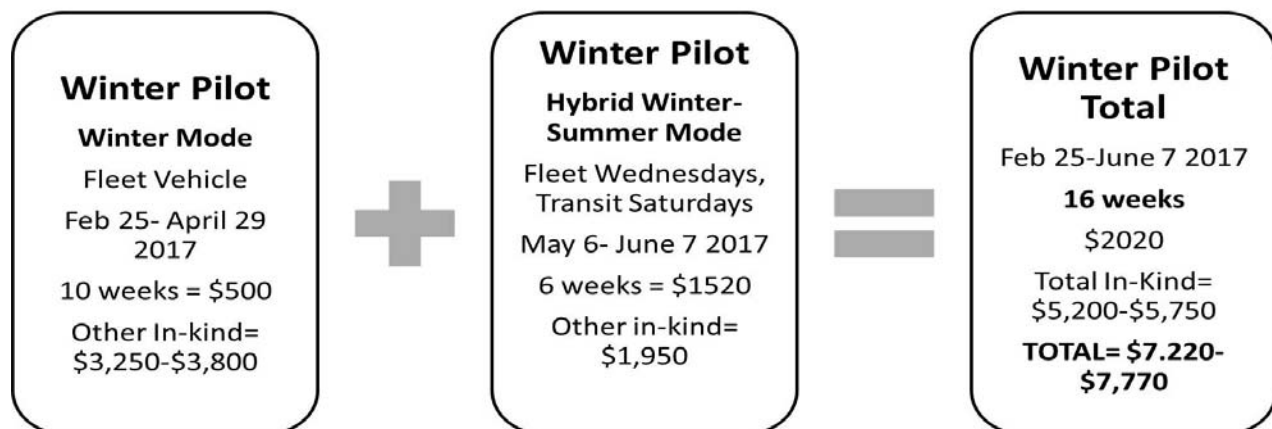
Figure 2 Winter Pilot Operations

The Advisory Team is seeking a similar in-kind contribution from HRM, modified to reflect changes to the routes, schedule and service model. Shifting to a weekday was problematic for Halifax Transit as the majority of transit resources (buses and operators) are fully utilized during the week. In addition, with the delivery model, Transit vehicles would need to idle to maintain a suitable temperature for the produce which raises idling and environmental concerns. As an alternative, staff explored the use of a Fleet Services vehicle for the winter pilot as the vehicles are available on weekdays and more suitably sized and designed for deliveries. Operations Support has agreed to provide a Fleet Services vehicle for use on market days for the duration of the Winter Pilot. The vehicle will be operated by staff of the MFM, who will be trained on HRM’s Fleet Operating Guidelines. Figure 2 explains the modes for the Winter Pilot and cost of the vehicle provision; HRM’s in kind vehicle support is anticipated to be valued at $2,020. The in-kind staff support is estimated at $5,200 to $5,750, depending on whether new communications products are developed. Table 3 summarizes the proposed HRM contributions to the Winter Pilot.