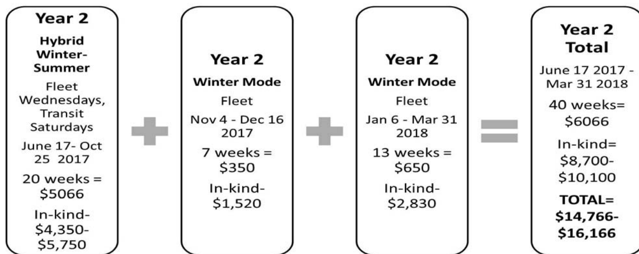
Table 4 HRM Contributions to Year 2 Transition