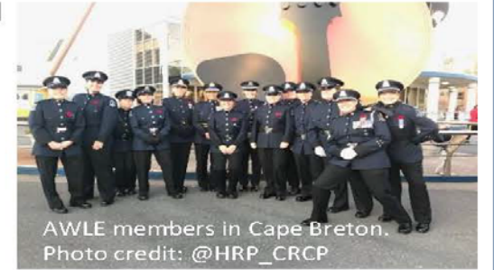
AWLE members in Cape Breton.