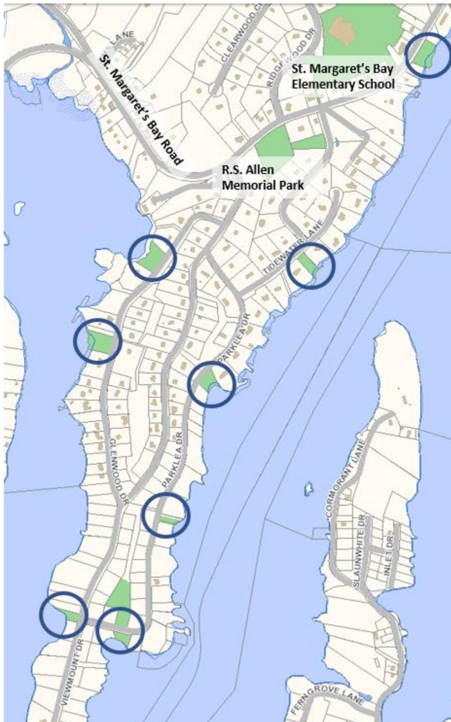
Map 2: HRM-owned waterfront parcels (circled)